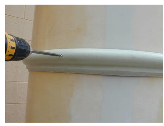
9) Using the 1-3/4" self-drilling screws, install the first neck ring half to the column, lining up the line to the bottom of the neck ring.