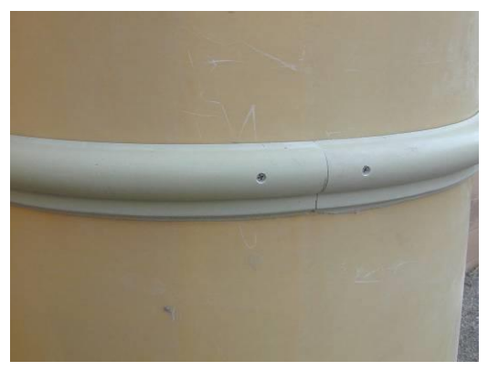
15) Check fit and install the second neck ring half with adhesive and screws.