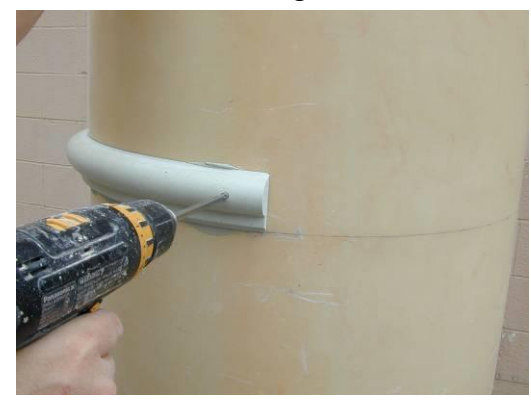
10) After installing the two screws in the center of the part, install the last two screws at the ends of the part. This sequence will result in a better fit.