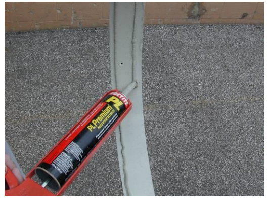
8) Apply adhesive to the trimmed neck ring half as shown above.