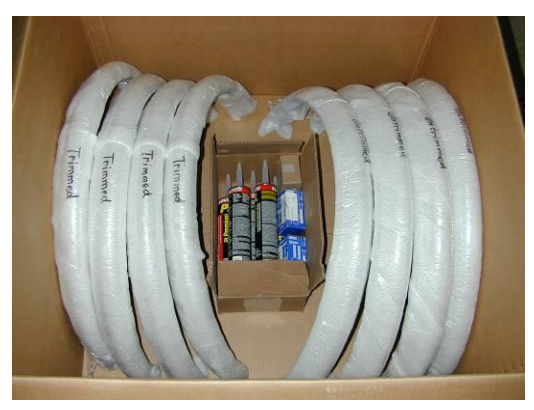
1) Box contents- neck rings, adhesive, screws. (quantities may be different)