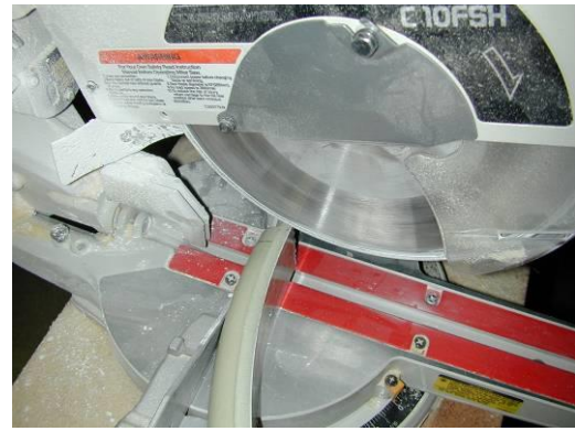
14) Use saw to cut neck ring to fit.