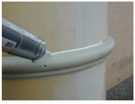
16) Apply a bead of good paintable exterior chalk at the top and bottom joint where the neck ring joins the column. Smooth bead for proper appearance.