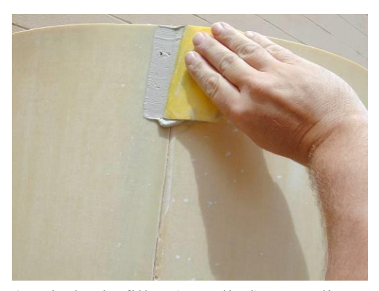
4) Mix body filler (supplied) according to manufacture's instructions and apply to joint. Make joint wide enough to make a smooth radius.