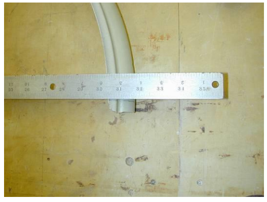
13) Mark with a straight edge for best fit.