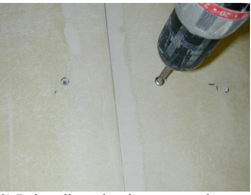
3) Reinstall pan head screws on the column half just assembled with adhesive.