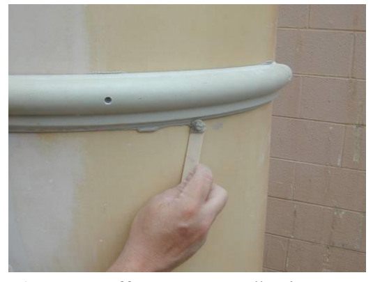
11) Scrape off any excess adhesive.