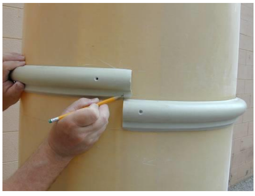
12) Hold the untrimmed neck ring half in position so it can be marked for proper fit.