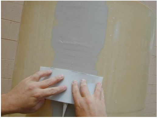
5) Smooth the body filler into a smooth radius using a thin sheet of plastic.

You may have limited working time after catalyzing the body filler. Do not try to patch too large an area.