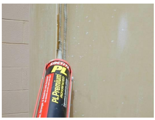
2) After trimming column sections to fit, apply adhesive to joints.