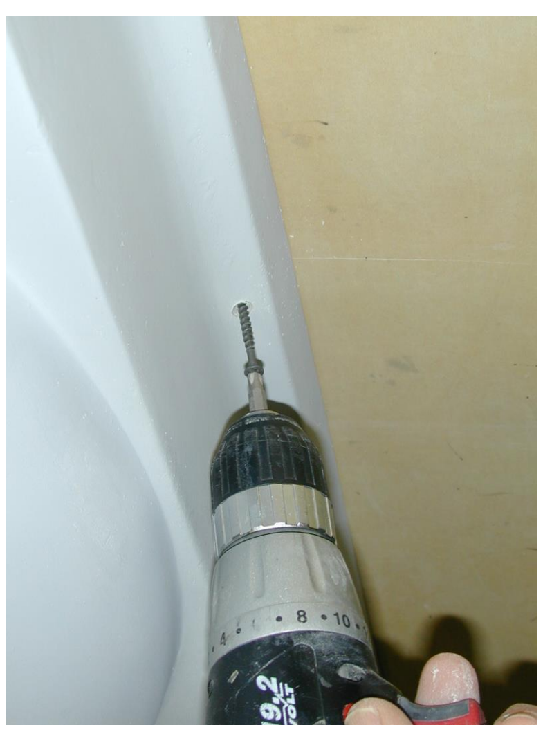
Capital Installation. Predrill and countersink before installing screw.