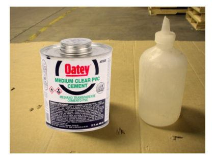
4) PVC cement may be easier to apply using a squeeze bottle. Be sure to return all unused cement to the original container.