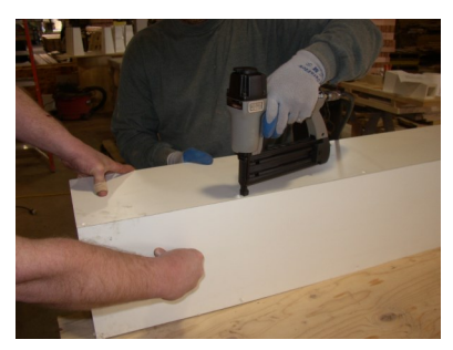
7) Using finish nails, assemble three panels together. Observe EZ-Lock diagram on reverse to determine correct nail placement.