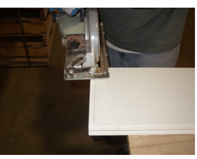
2) PVC expands and contracts with temperature changes. Trim shaft pieces to 1/2" shorter than opening height (from step 1) to allow for product expansion.