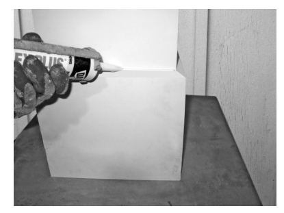
15) Caulk edges of base, cap, and nail holes.

16) Clean surface of column with cleaner recommended by the paint manufacturer. (Do not use solvents). Allow to dry completely, then paint with 2 coats of acrylic latex paint. Warning: using dark colors might cause excessive thermal expansion.