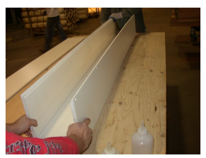
6) Assemble three panels, using E-Z Lock joints.