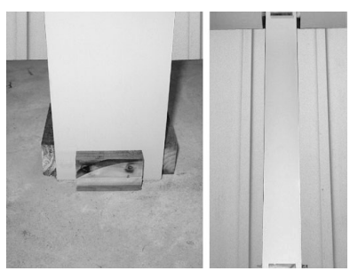
3) If desired, optional blocking (not provided) may be installed around post to center wrap. This is especially helpful when wrapping round or odd sized supports.