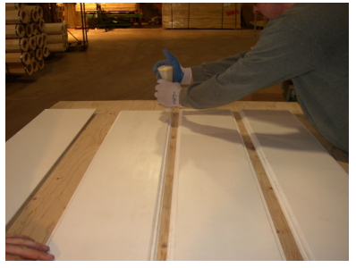
5) Lay 3 panels flat and apply adhesive to center joints.