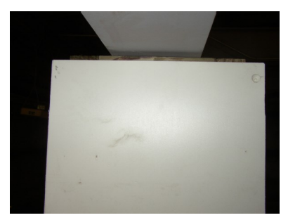
13) The TOP of the shaft should NOT be fastened to the post and there should be at least 1/2" gap to allow expansion (see step 2).