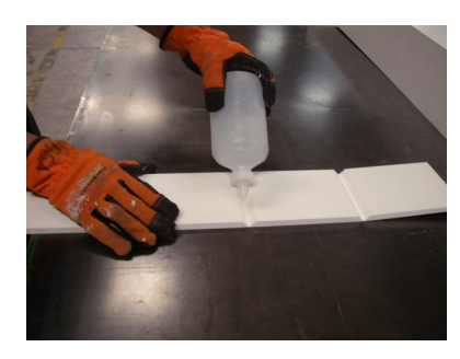
11) Apply adhesive to mitered edges of base moulding and wrap around bottom of column shaft.