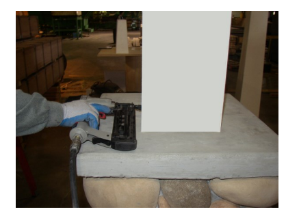
10) Nail column to post ONLY ON THE BOTTOM . Do not attach at center or top (to allow for expansion).