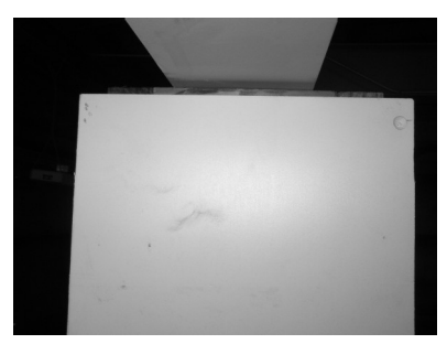
13) The TOP of the shaft should NOT be fastened to the blocking, and there should be at least \frac{1}{4} gap to allow expansion (see step 4).