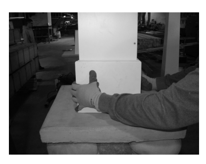
11) Apply adhesive to mitered edges of base moulding (standard base is 9¼" tall) and assemble around bottom of column shaft.