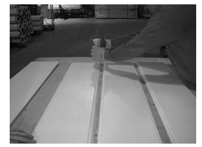
5) Lay 3 panels flat and apply adhesive to center joints.