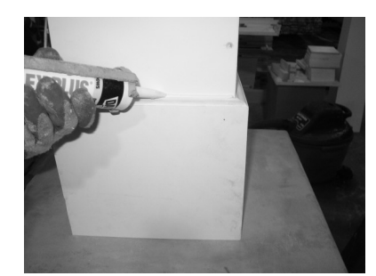
17) Caulk edges of base, cap, and nail holes.