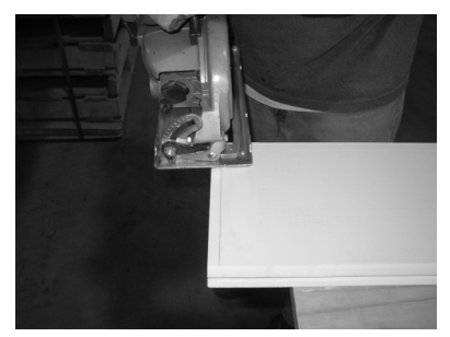
4) Trim shaft pieces at least ¼" shorter than opening height (from step 1). Trim ONLY from the bottom—top end is marked.