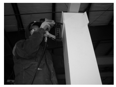
15) Option 1: Attach cap to soffit with construction adhesive and toenail to soffit. DO NOT ATTACH cap to column shaft if the cap is flush with soffit (to allow expansion).*