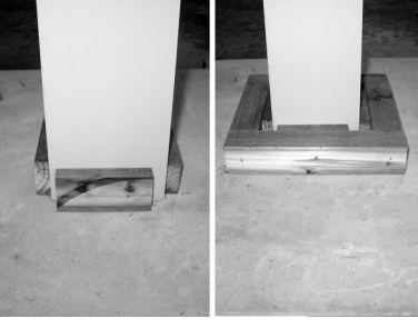
2) Install blocking around load bearing post (use pressure treated lumber.) Final width of blocking must be same width as inside of column.