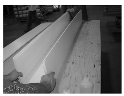
6) Assemble three panels, using E-Z Lock joints.