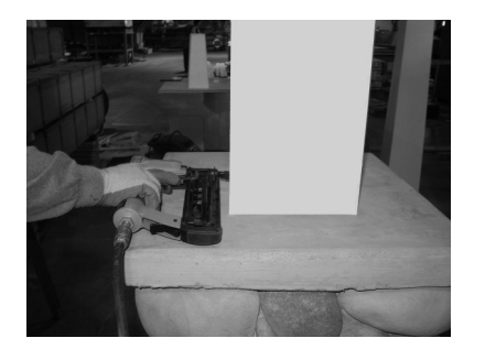
10) Screw or nail column to blocking ONLY ON THE BOT-TOM. Do not attach at center or top (to allow for expansion).