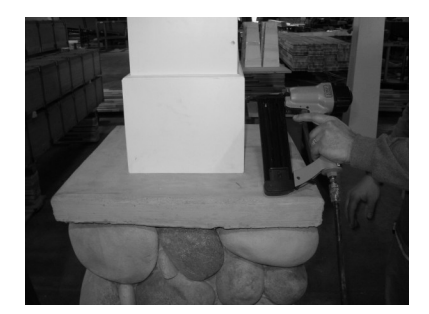
12) Fasten joints on base with pinnails.