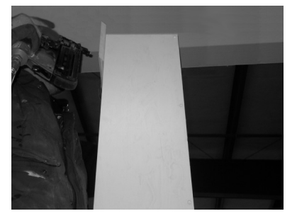
14) There are TWO methods of attaching the cap. First, apply adhesive to mitered edges of cap moulding (7\frac{1}{4}) tall) and assemble around shaft and pin-nail joints.